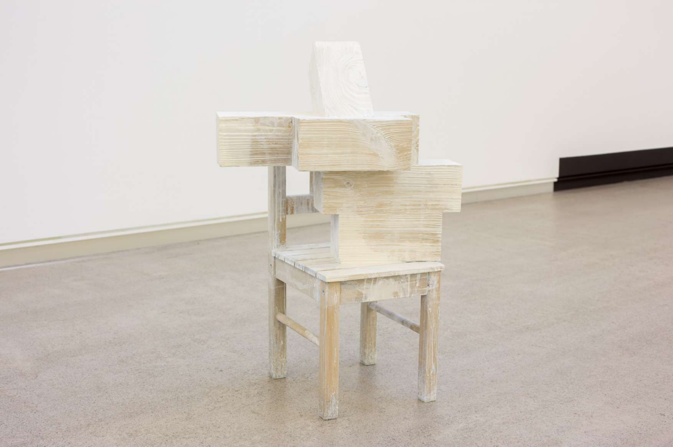
Bikote (zuria) , 2019 Wood construction and paint. 62 x 52 x 34 cm.