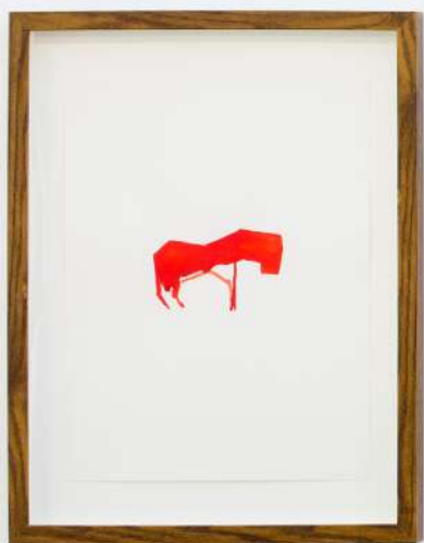
Bestiario III , 2019 Watercolour on paper. 40 x 30 cm.