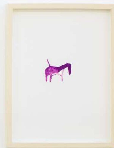
Bestiario V , 2019 Watercolour on paper. 40 x 30 cm.