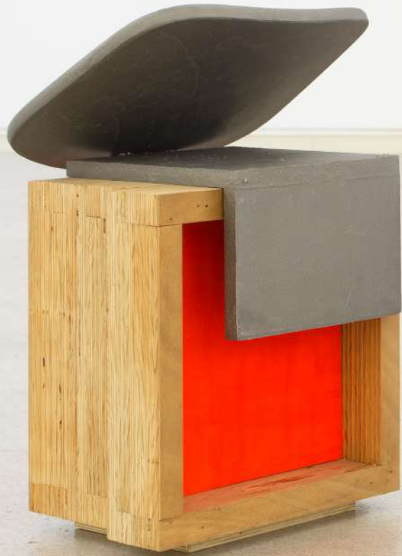
Mutante II , 2019 Plywood, welded aluminium elements and paint. 53 x 37 x 28 cm.