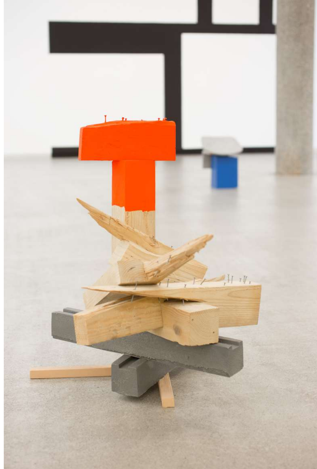
Dardara , 2019. Cast and welded aluminium elements, wood, nails and paint. 60 x 60 x 64 cm.