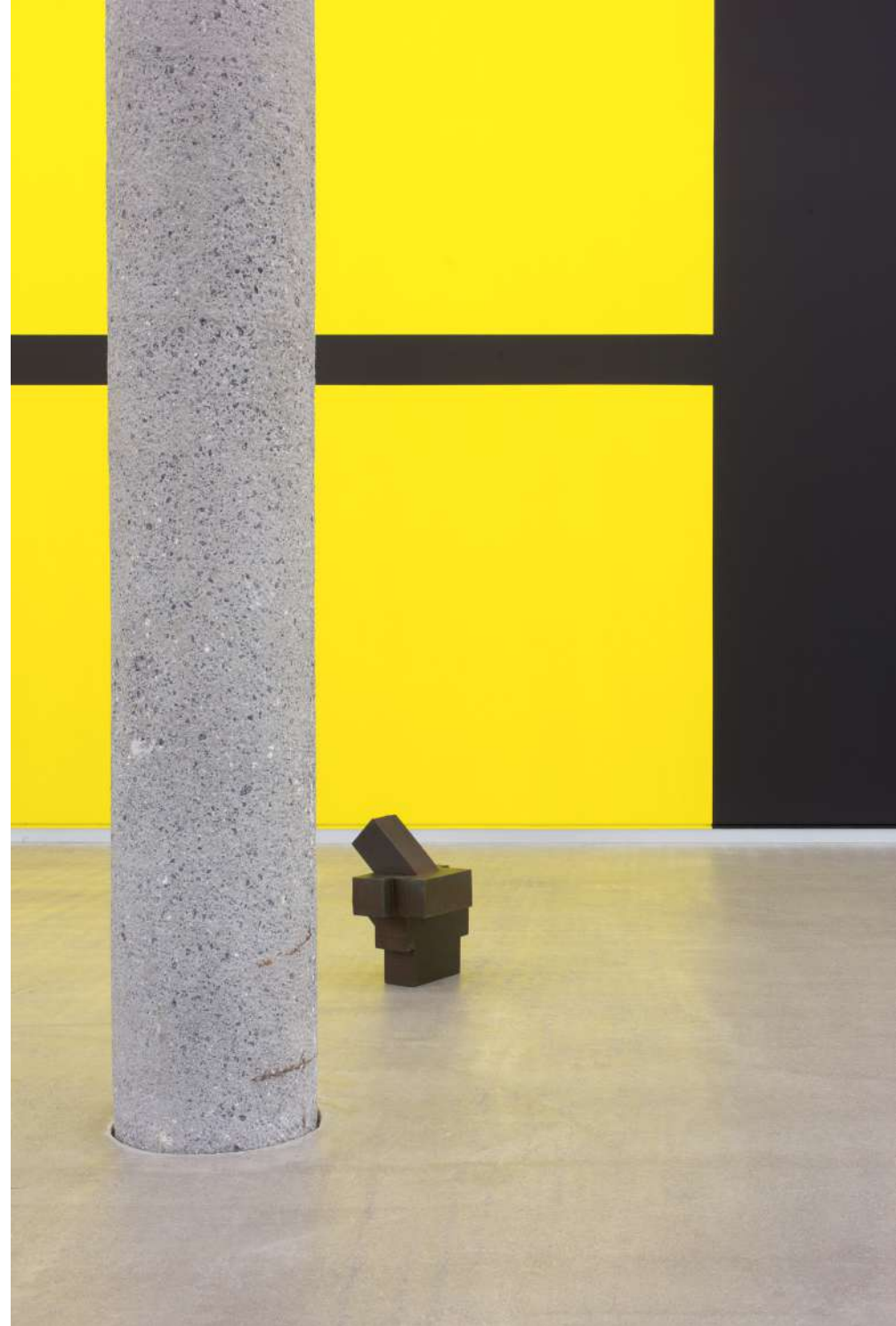
Bikote , 2019 Iron. 44 x 39 x 38 cm.