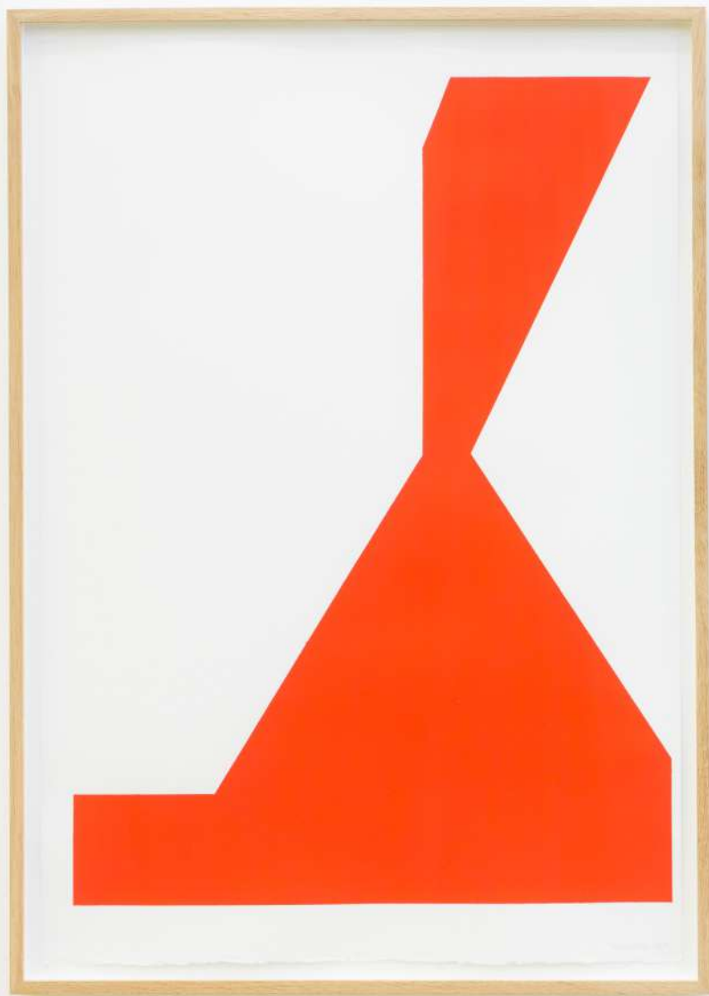
Sólido I, 2019 Paint on paper. 100 x 70 cm.