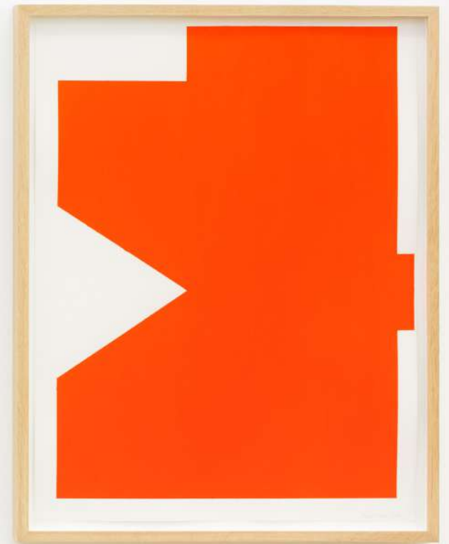
Abecedario II , 2019 Paint and collage on paper. 65 x 50 cm.