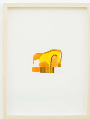
Bestiario IV , 2019 Watercolour on paper. 40 x 30 cm.