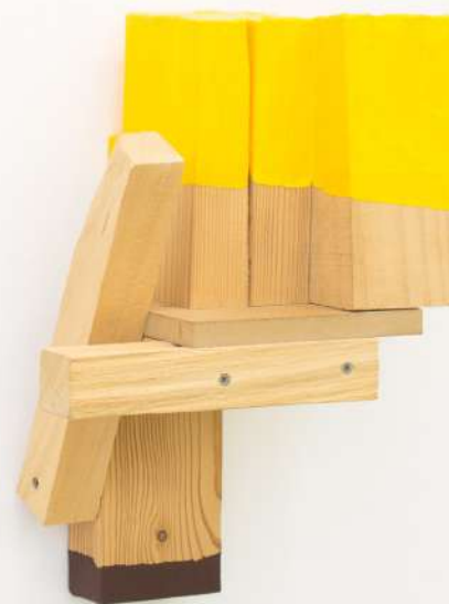
Saludo , 2019 Wood construction and paint. 40 x 23 x 24,5 cm