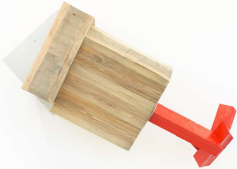
Untitled, 2019. Wood construction, galvanized steel and paint. 85 x 120 x 46 cm.