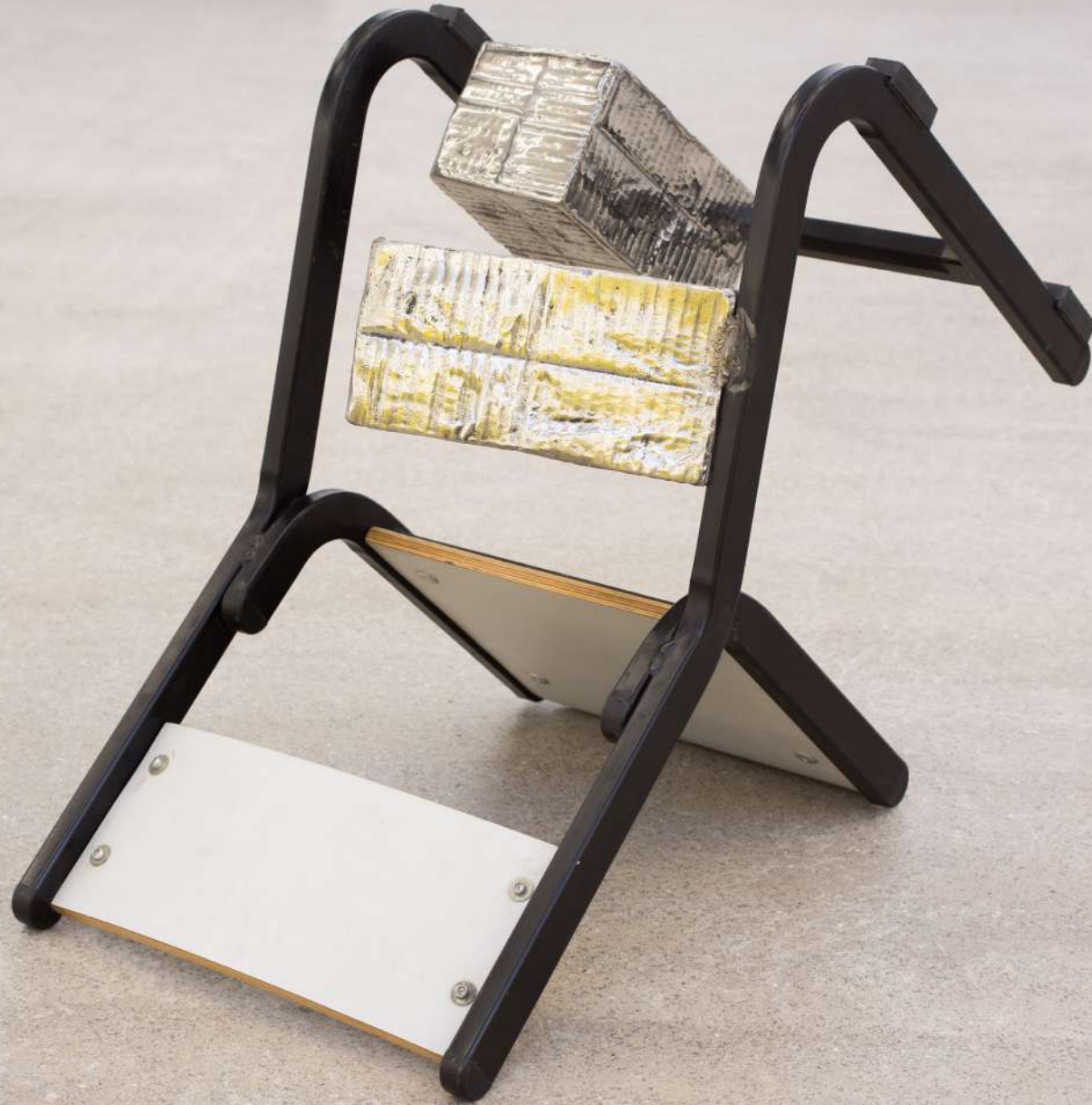
Dardara (interior) , 2019 Iron, wood, cast and welded stainless steel elements and paint. 46 x 63 x 32 cm.