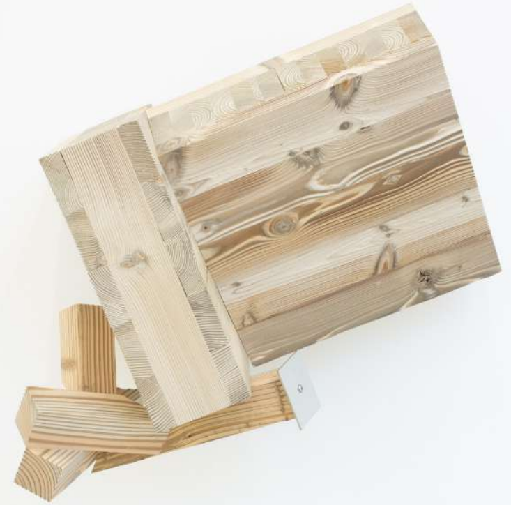
Untitled, 2019. Wood construction and galvanized steel. 85 x 80 x 45 cm.