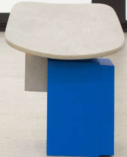
Mutante I , 2019 Cast and welded aluminium elements, wood and paint. 45 x 35 x 29 cm.