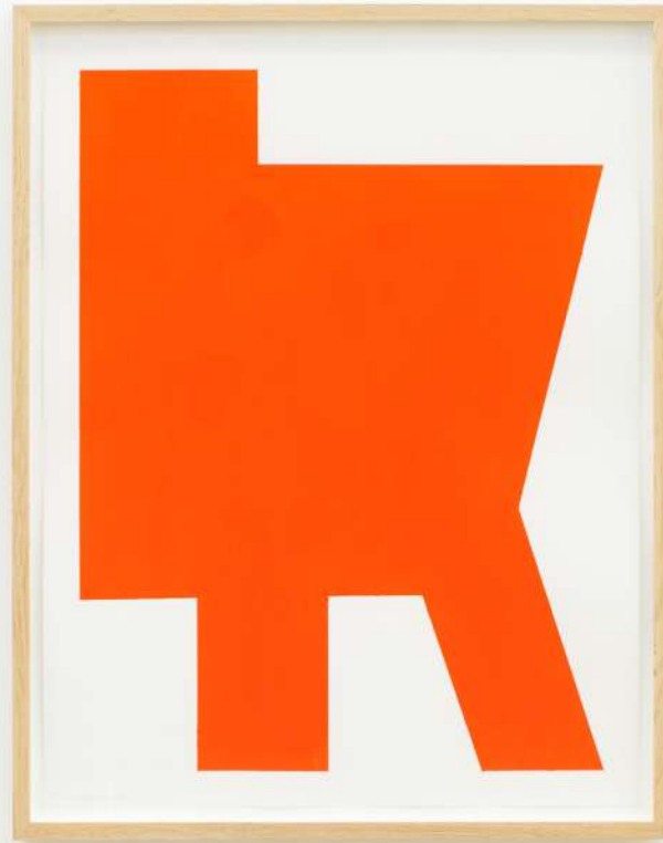
Abecedario I , 2019 Paint and collage on paper. 65 x 50 cm.