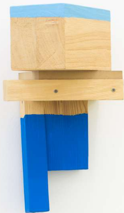
Saludo (paisaje) , 2019 Wood construction and paint. 40 x 23 x 24,5 cm