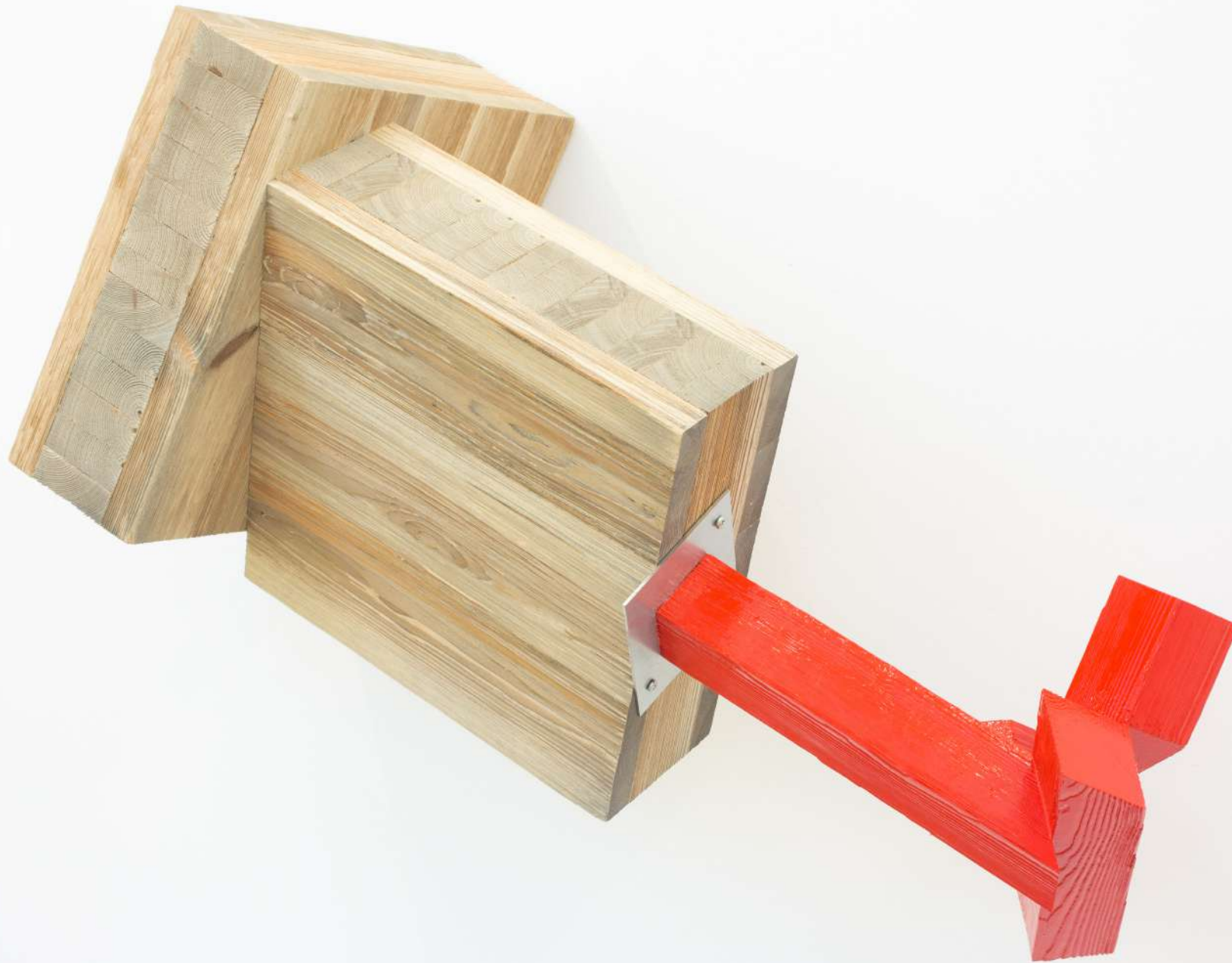
Untitled, 2019. Wood construction, galvanized steel and paint. 85 x 120 x 46 cm.