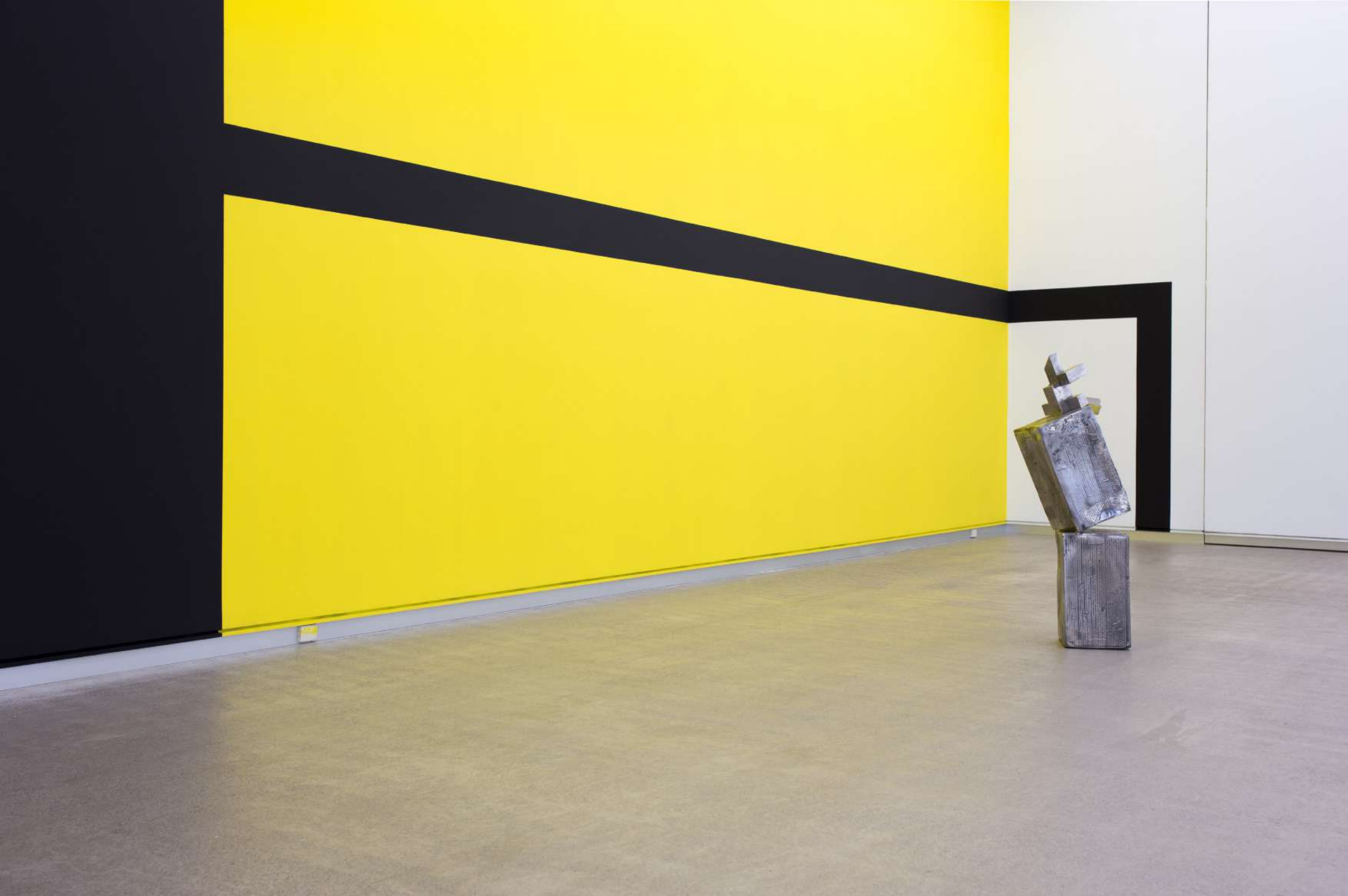
Ibiltari , 2019 Cast and welded stainless steel elements and paint. 92 x 24 x 28 cm.