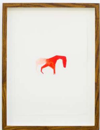
Bestiario II , 2019 Watercolour on paper. 40 x 30 cm.