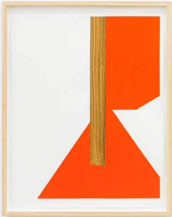
Abecedario III , 2019 Paint and collage on paper. 65 x 50 cm.