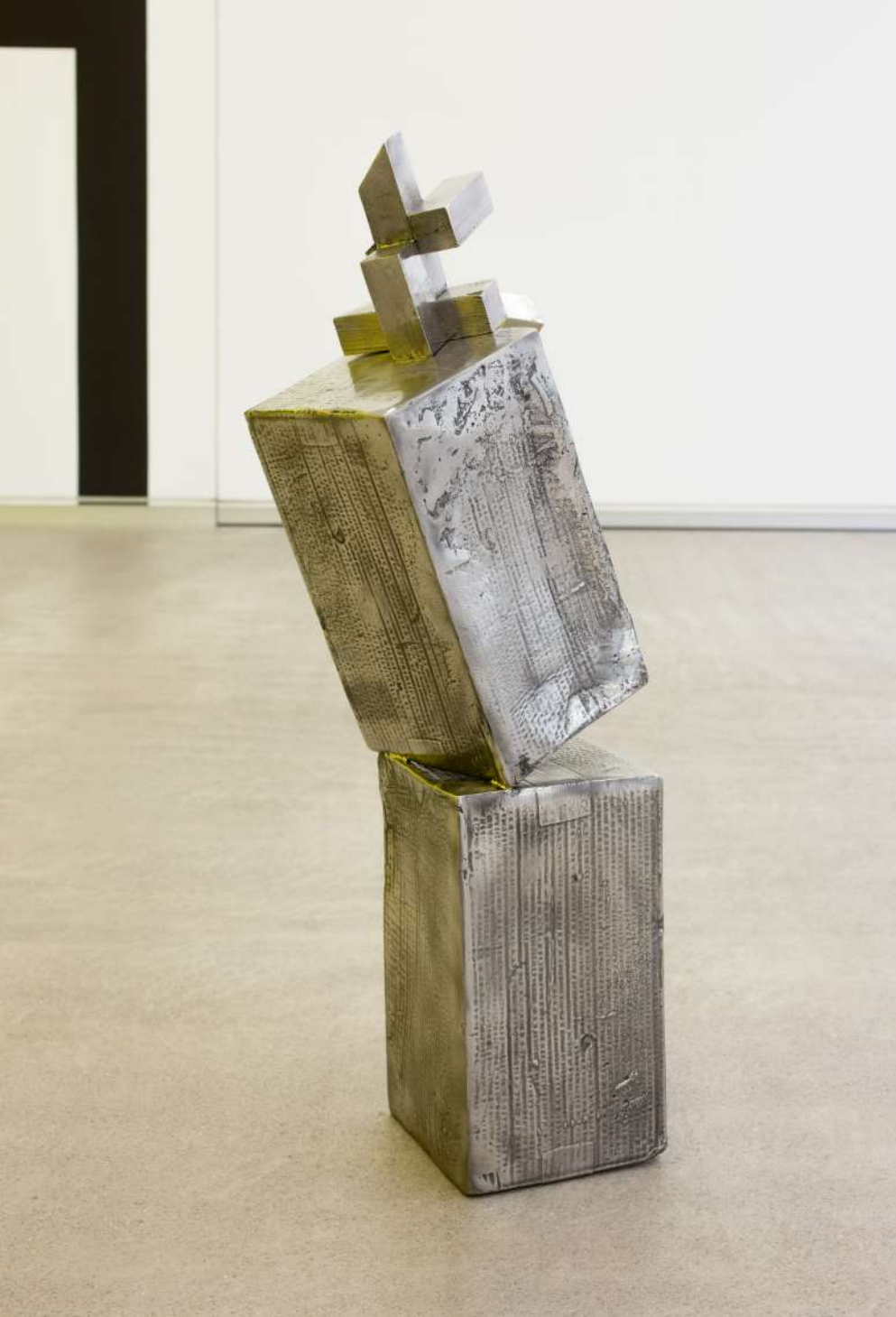
Ibiltari , 2019 Cast and welded stainless steel elements and paint. 92 x 24 x 28 cm.