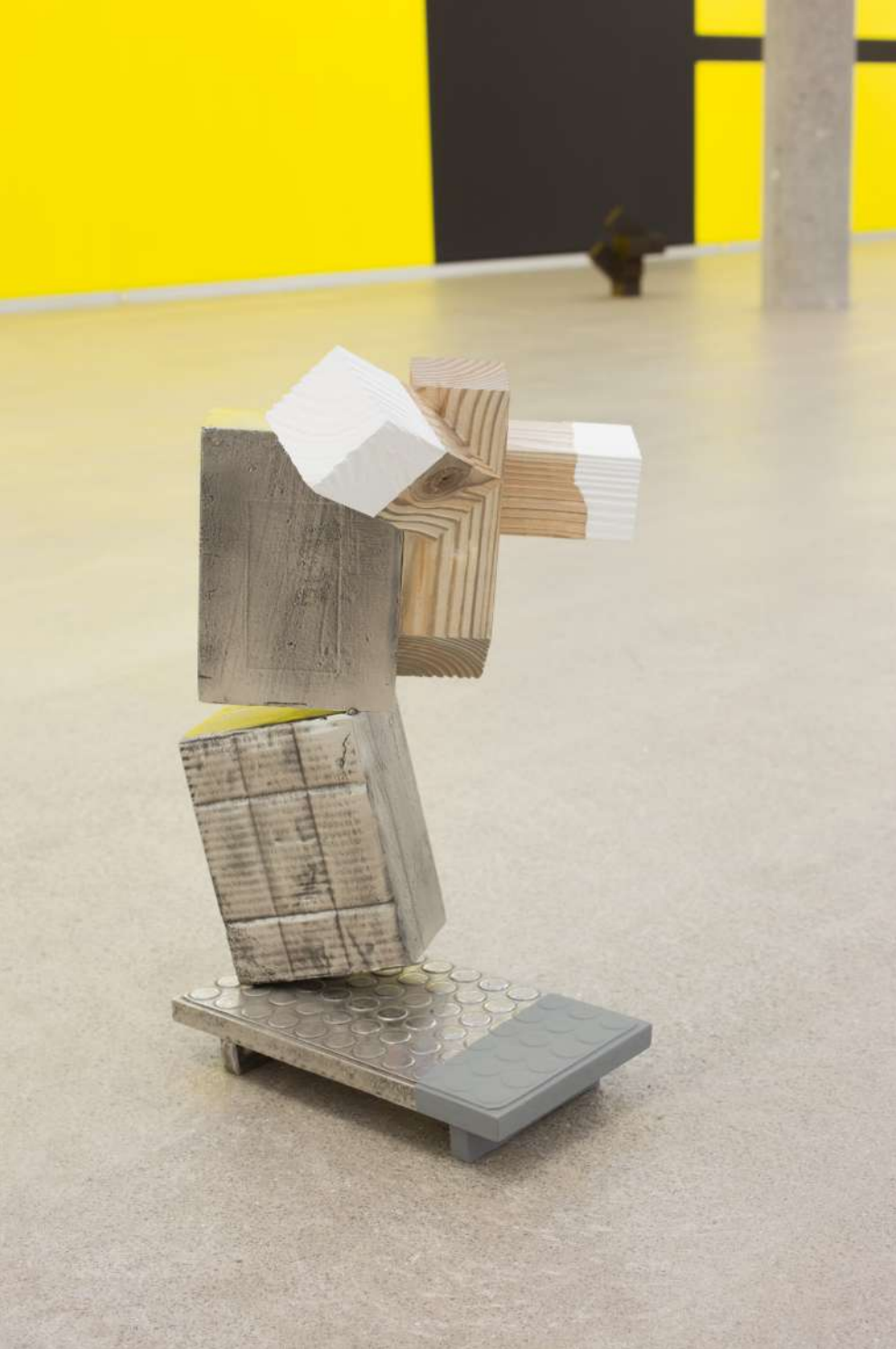
Dardara III , 2019. Cast and welded stainless steel elements, wood and paint. 56,5 x 37 x 35 cm.