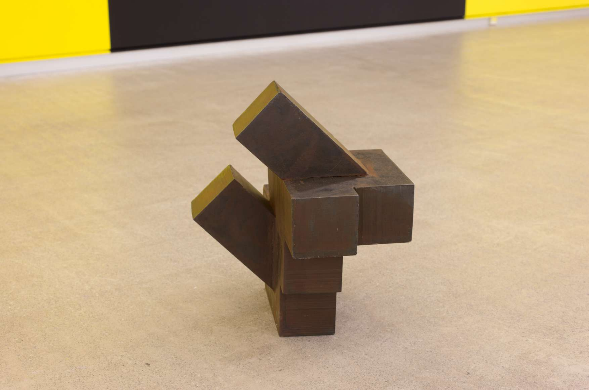
Bikote , 2019 Iron. 44 x 39 x 38 cm.