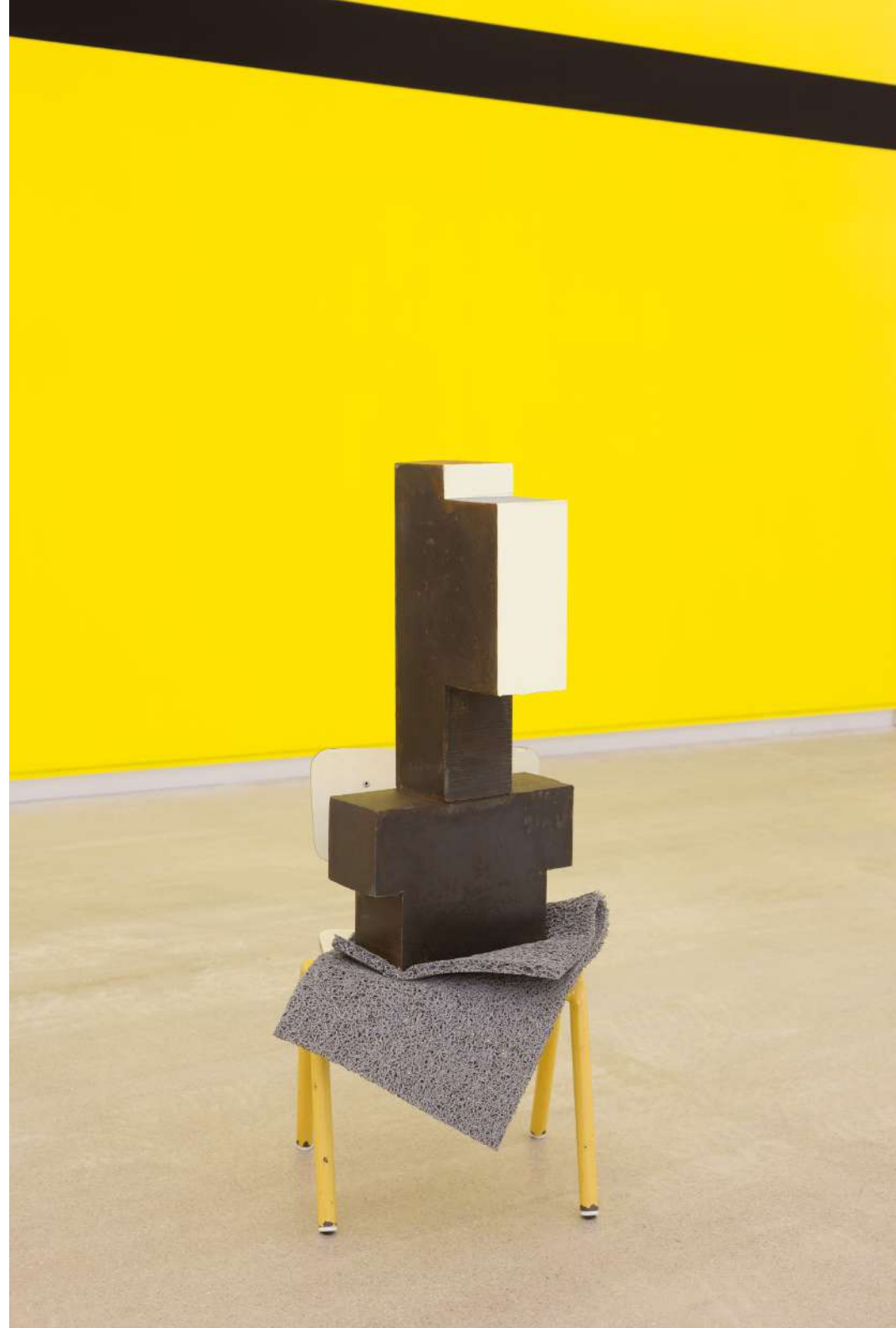
Dardara I , 2019 Steel, wood, iron, felt and paint. 91 x 40 x 40 cm.