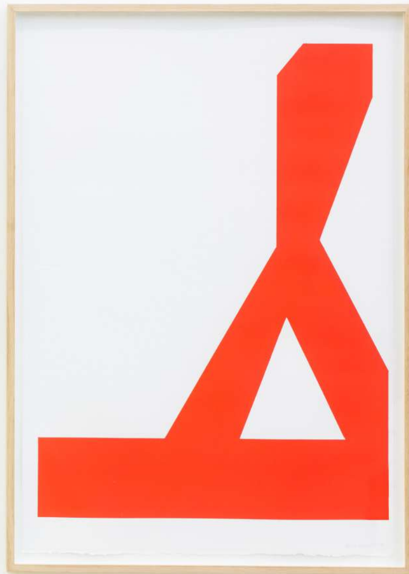
Sólido II, 2019 Paint on paper. 100 x 70 cm.