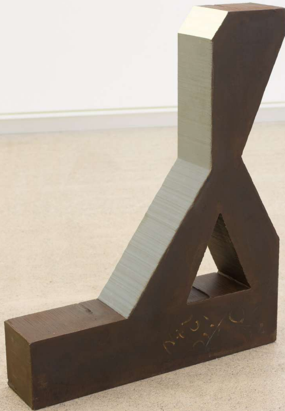
Sólido, 2019 Iron and paint. 58,5 x 47 x 18 cm.