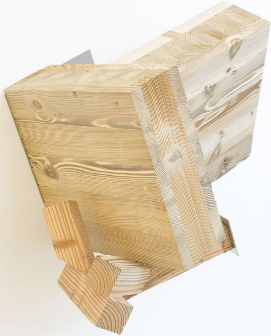
Untitled, 2019. Wood construction and galvanized steel. 85 x 80 x 45 cm.